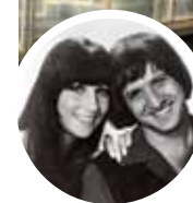
901 Mandalay Beach Road features four bedrooms and a pedigreed past: Sonny Bono and Cher (inset) once lived there. It's on the market for $2.2 million; Cuoco has this listing as well.

$3 million versus $8 million to $10 million in Malibu. Plus, you are not going to run into your boss, or someone who is going to pitch something to you. You can be totally incognito. Yet at the same time it's very accessible: You can rise early on a Monday morning and still get into work back in L.A. if you want to."